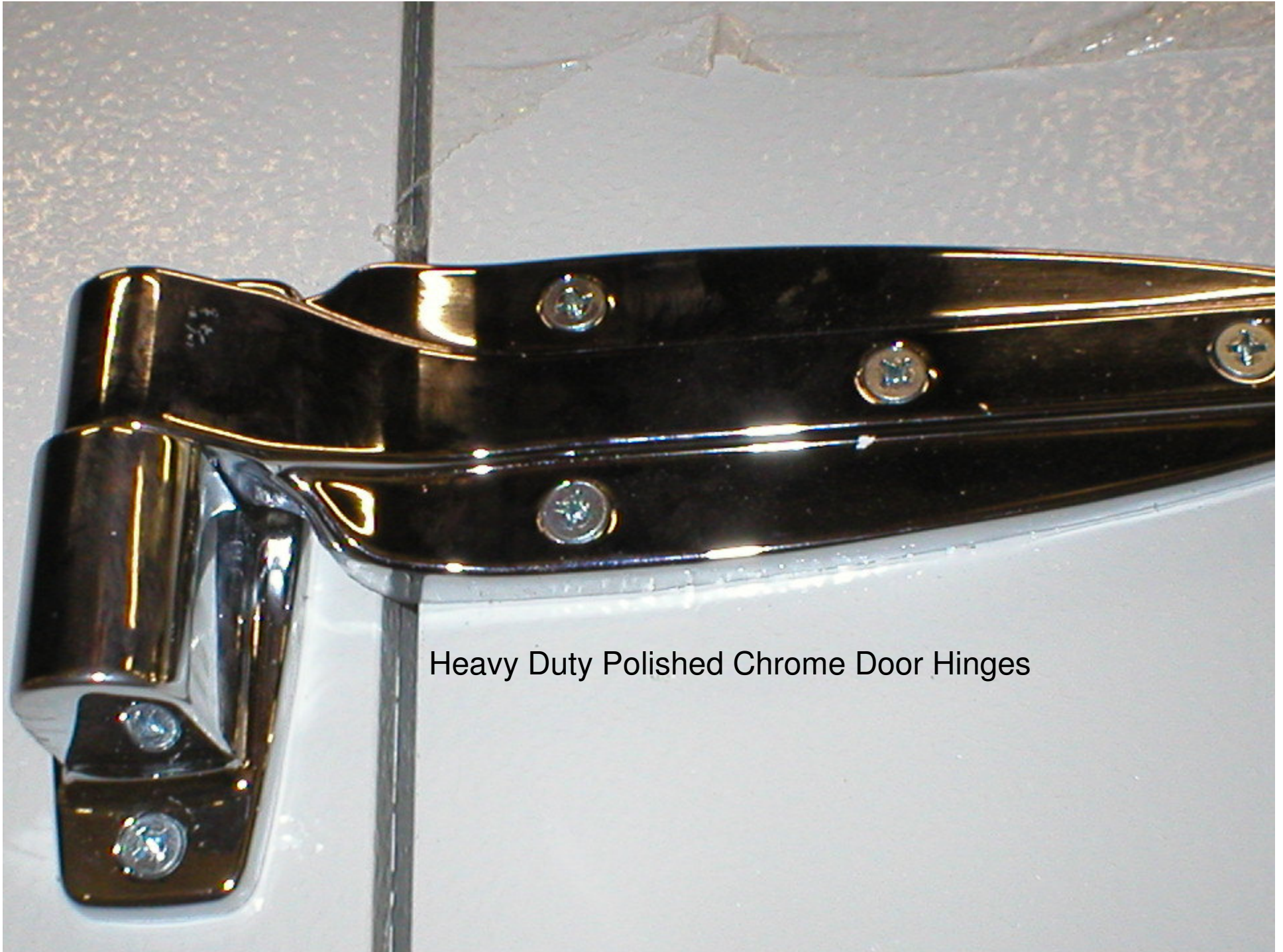
Heavy Duty Polished Chrome Door Hinges