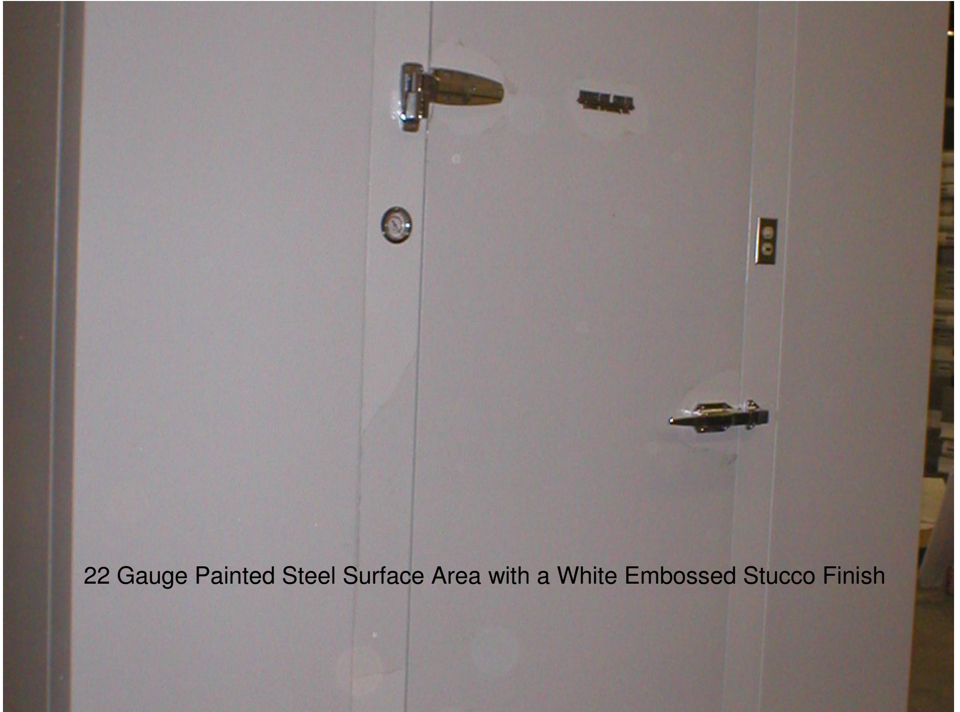
22 Gauge Painted Steel Surface Area with a White Embossed Stucco Finish