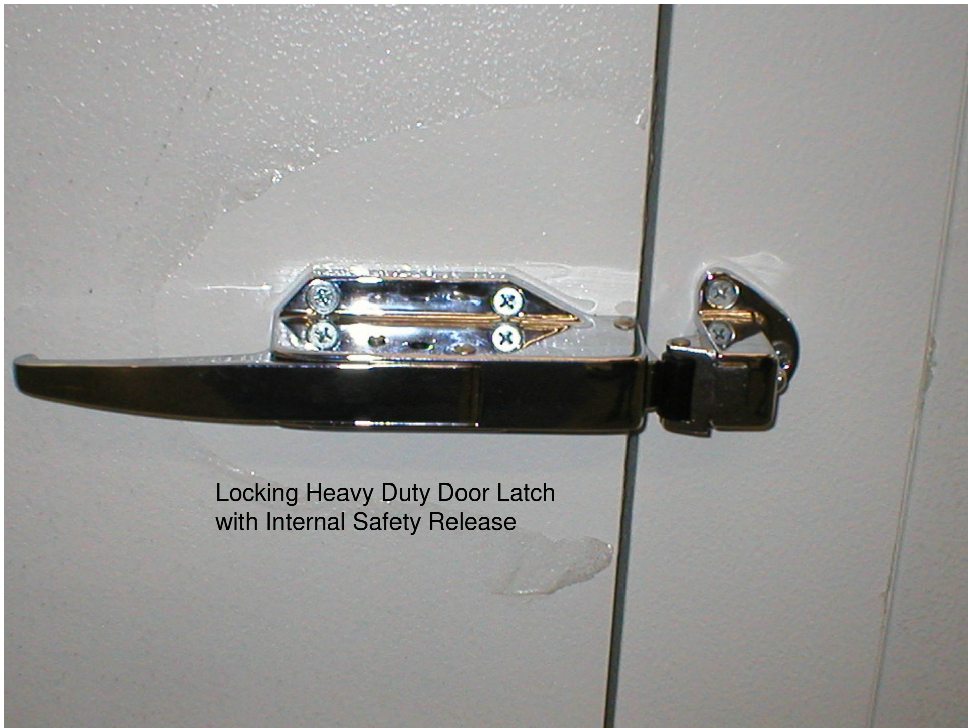
Locking Heavy Duty Door Latch with Internal Safety Release