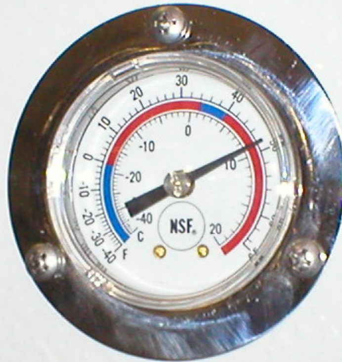
Easy to Read Internal Cooler Temp Indicator