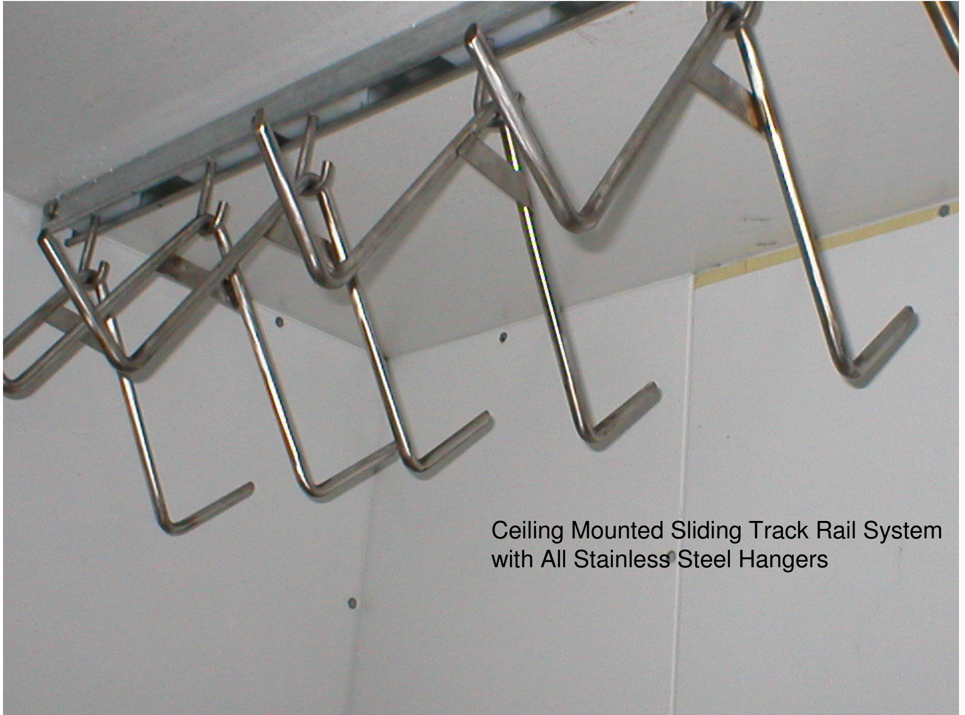
Ceiling Mounted Sliding Track Rail System with All Stainless Steel Hangers